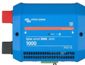
Lynx Smart BMS 1000 A