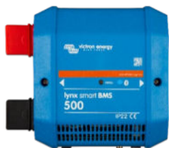
Lynx Smart BMS 500 A