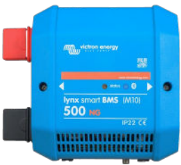
Lynx Smart BMS NG 500A