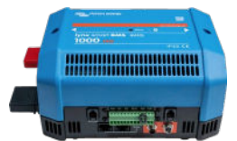
Lynx Smart BMS NG 1000A