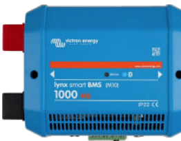
Lynx Smart BMS NG 1000A