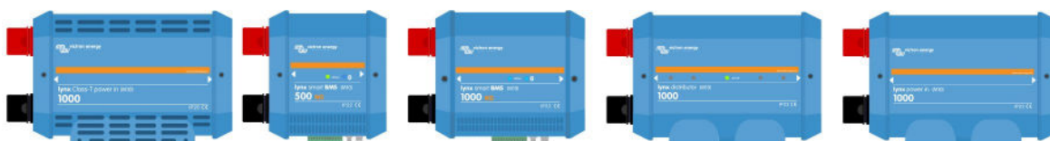
Lynx Distribution products with M10 busbars