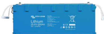
25,6 V 200 Ah Lithium NG battery