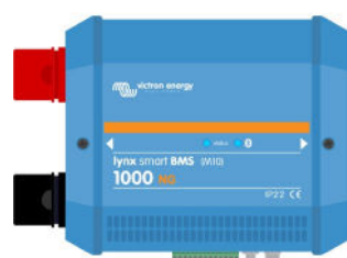
Lynx Smart BMS NG 500 A & 1000 A