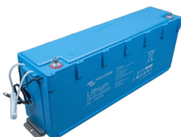
Secured with mounting brackets