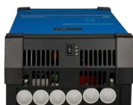
MultiPlus 2000 VA (with bottom cover)