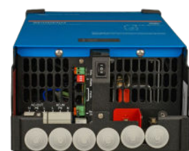
MultiPlus 2000 VA (bottom cover removed)