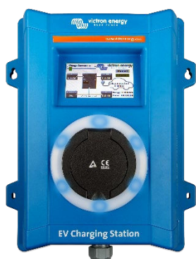
EV Charging Station