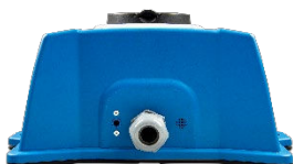
EV Charging Station - Back