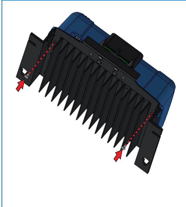
STEP 1: Mount the 'steel base' to the MPPT before installation to the wall.