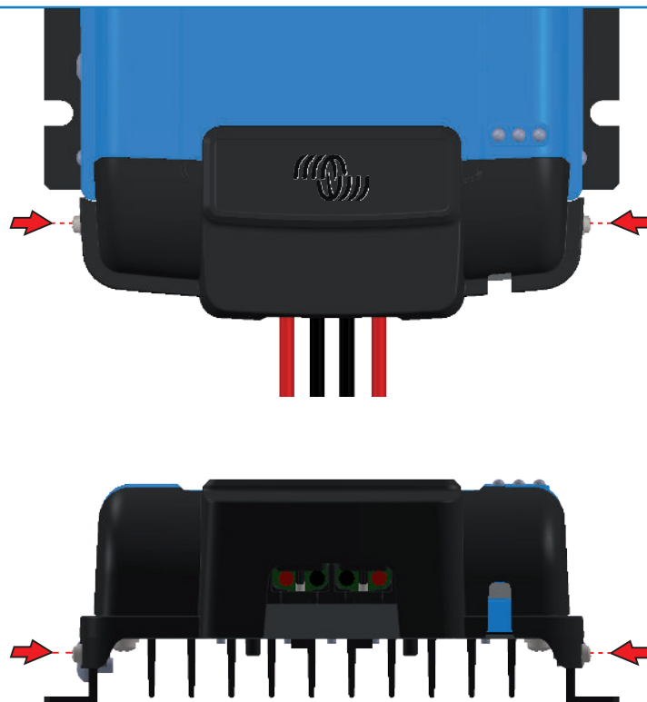
STEP 3: Place the WireBox cover and fasten with two screws.