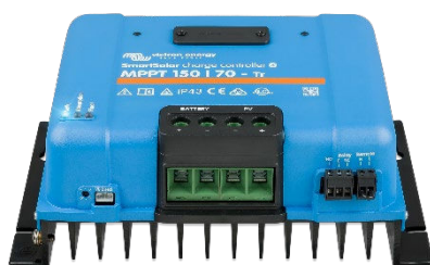
SmartSolar Charge Controller MPPT 150/70-Tr without optional display