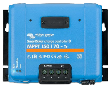
SmartSolar Charge Controller MPPT 150/70-Tr without optional display