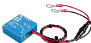
Bluetooth sensing: Smart Battery Sense