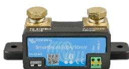
Bluetooth sensing: SmartShunt