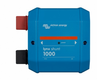
Lynx Shunt VE.Can