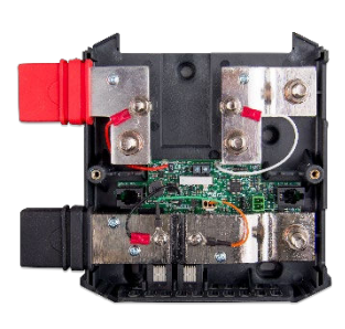
Lynx Shunt VE.Can without cover