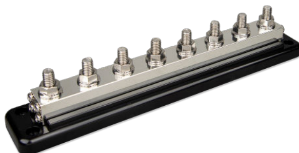
Busbar 600 A with 8 high current terminals and 8 low current screw terminals, without cover