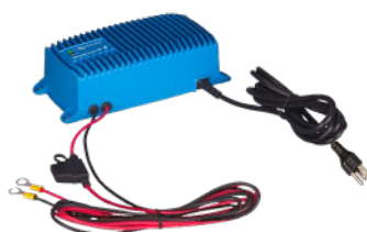
Blue Smart IP67 Charger 12/25